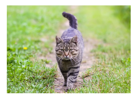
Listen to the clues. Guess which picture is the lost pet.