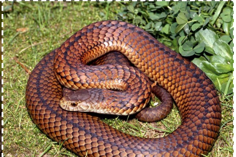
Line (Lowlands copperhead snake)