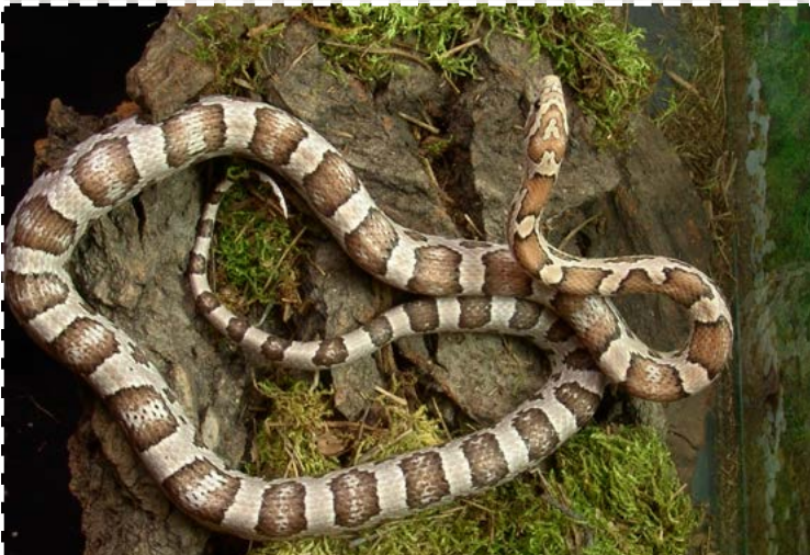
Hose (Corn snake ghost)