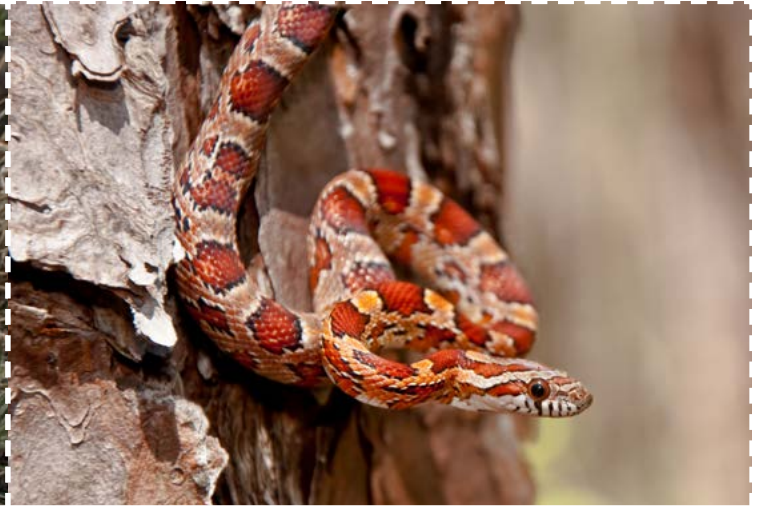
Hotdog (Corn snake)