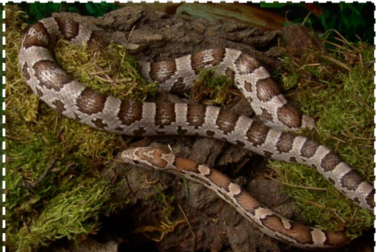
Rope (Corn snake ghost)