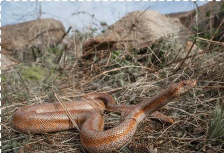
Cord (Northern 3-lined boa / coastal rosy boa)