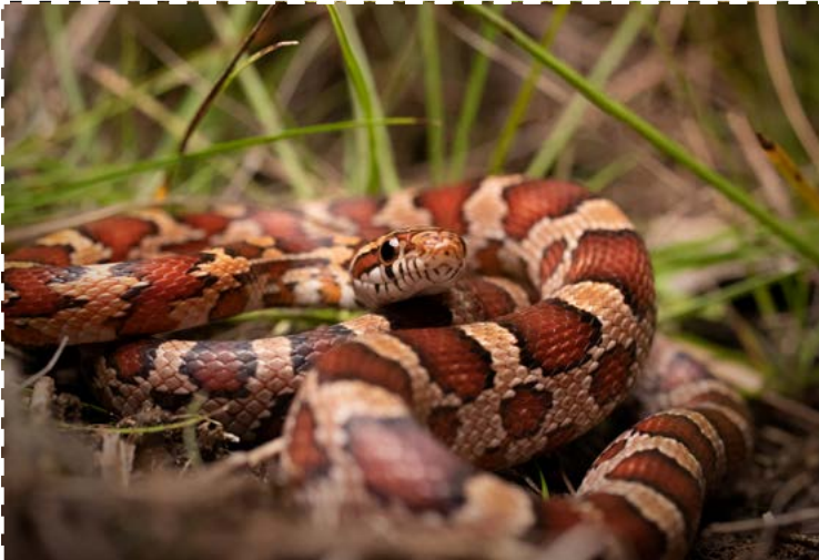
Pipe (Red corn snake)