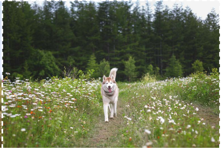
Darwin (Siberian husky dog)