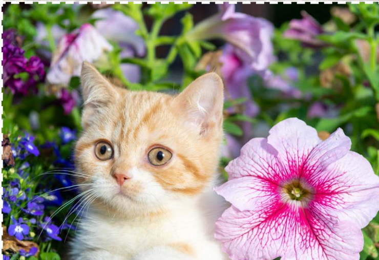
Coral (British red shorthair kitten)