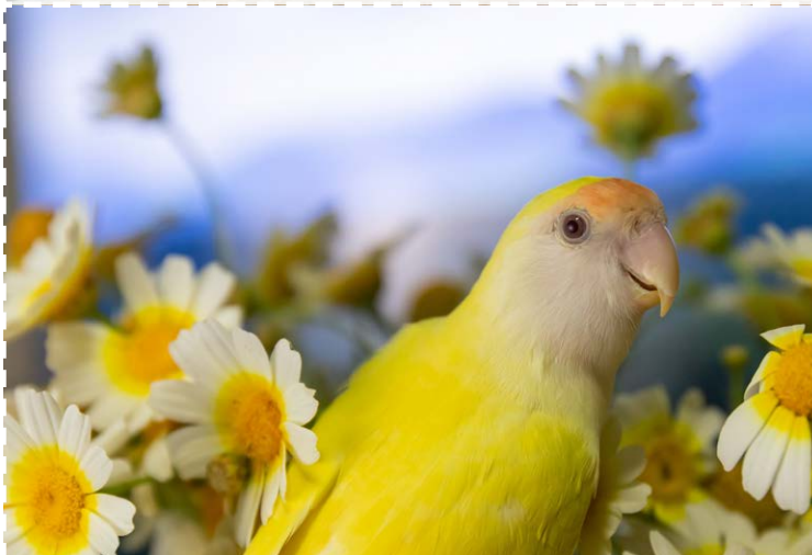
Sparky (Rosy-faced lovebird)