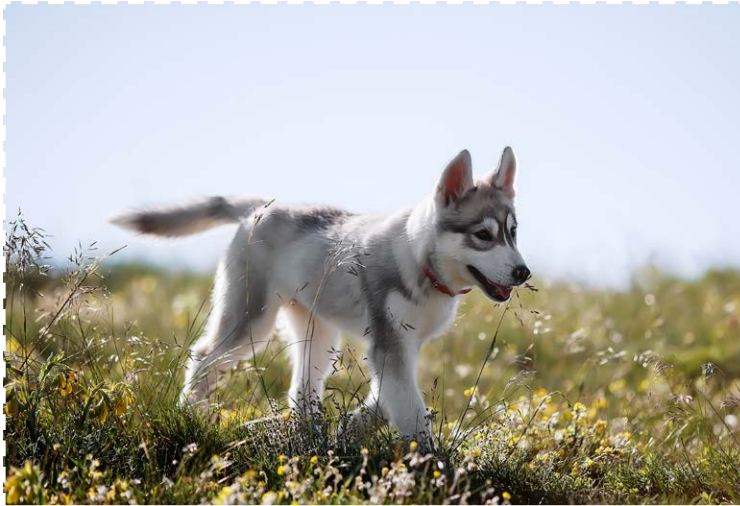
Ada (Husky puppy)