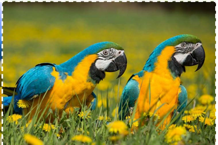
Dot and Dash (Macaw birds)